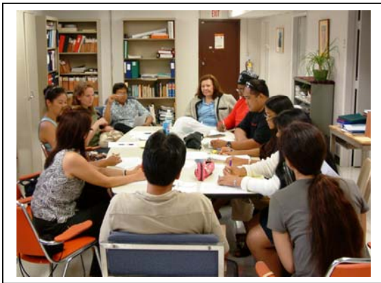
The Student section meeting