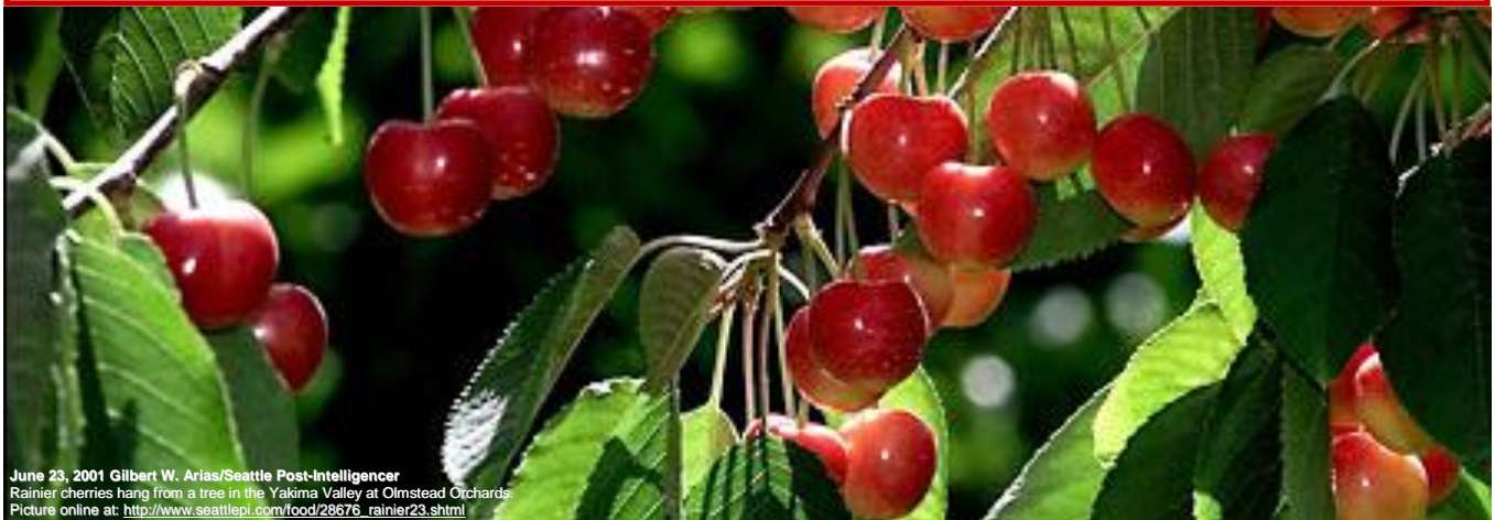
June 23, 2001 Rainier cherries hang from a tree in the Yakima Valley at Olmstead Orchards. Picture online at: http://www.seattlepi.com/food/28676_rainier23.shtml